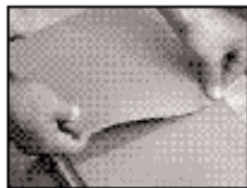
2. Position second Dekstrip over tape & press in place.