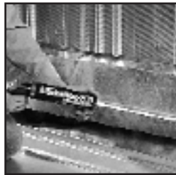
2. Apply a continuous bead of sealant along chalk line.