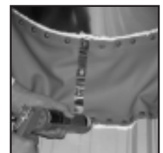
6. Apply sealant to all seams.