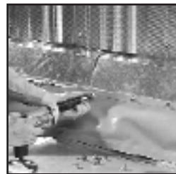
3. Position top edge of Dekstrip over seal bead and install Buildex fasteners at 1-1/2" maximum intervals on top edge. Repeat steps 1, 2, and 3 for the bottom edge.