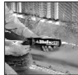
4. Apply additional sealant to both fastened edges for maximum weather-tight sealing.