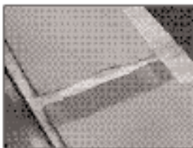
1. Apply splice tape to Dekstrip.