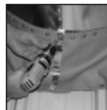
5. Fasten through top of termination strip, Dekstrip, and back of strip with Scotsfasteners or rivets.