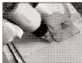
3. Apply heat and press firmly to seal edges.