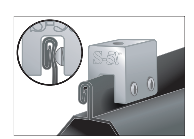
*S-5! clamps are designed to engage the seam.